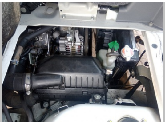
Engine from the right