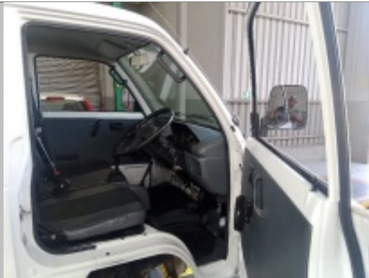
INTERIOR (FRONT DRIVER DOOR)