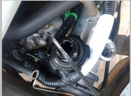
Oil filler cap and Dipstick