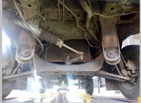
Chassis from the front