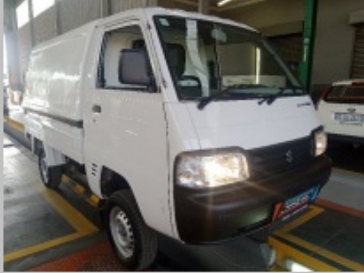
FRONT RIGHT CORNER