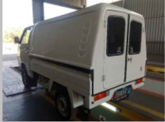
REAR LEFT CORNER