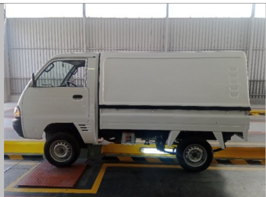
90 DEGREE LEFT