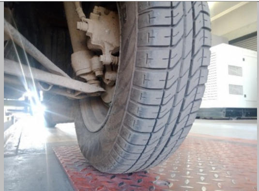
LF TYRE TREAD