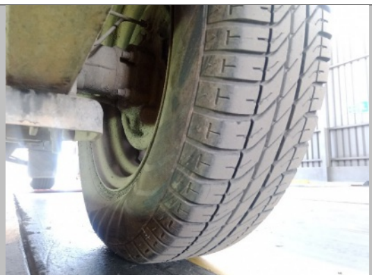
RR TYRE TREAD