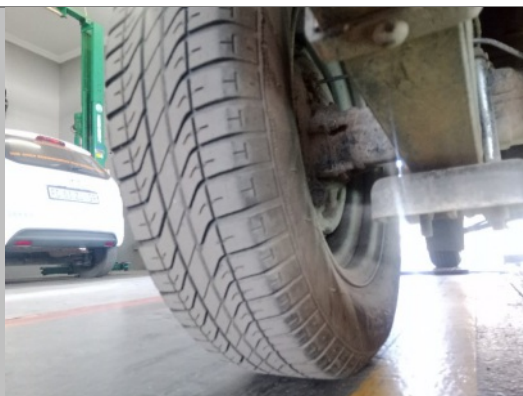
LR TYRE TREAD