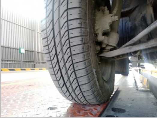
RF TYRE TREAD