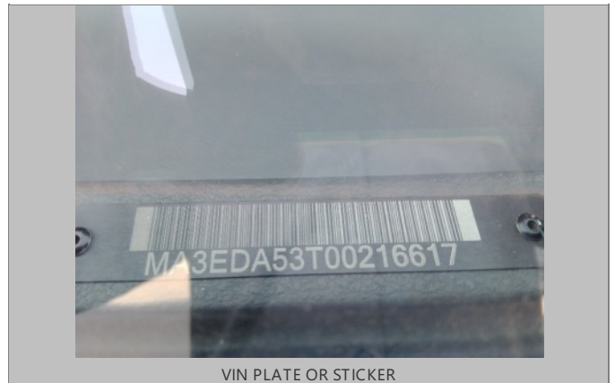
VIN PLATE OR STICKER