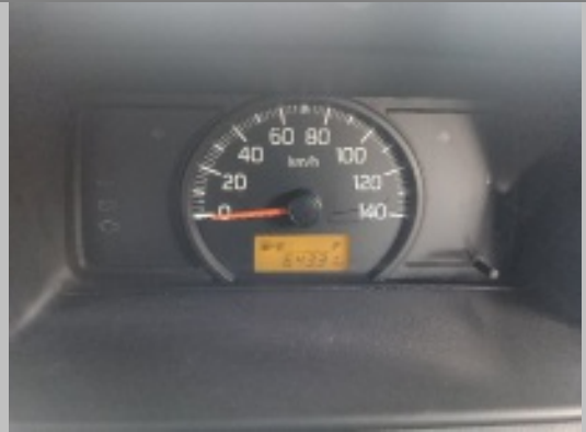
DASHBOARD (W/ ENGINE RUNNING)