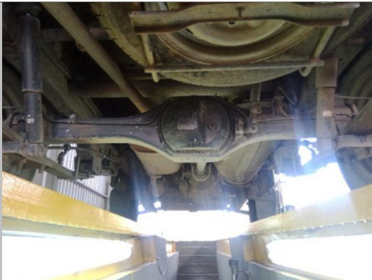
Chassis from the rear