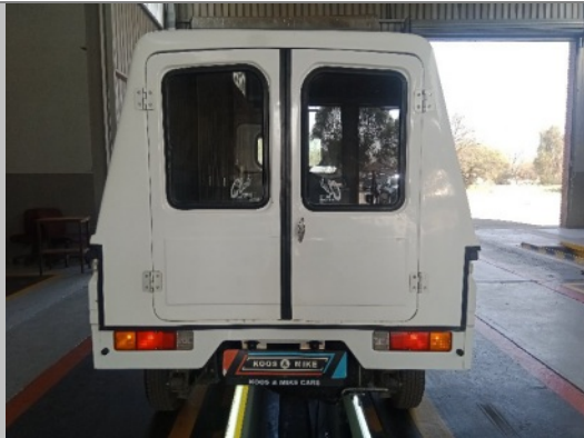
90 DEGREE REAR