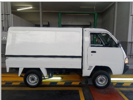
90 DEGREE RIGHT