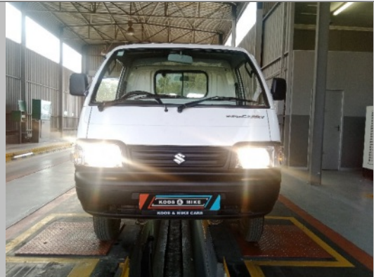
90 DEGREE FRONT