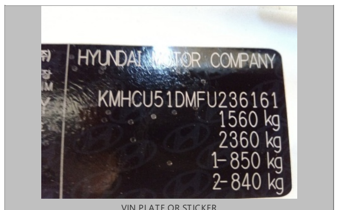
VIN PLATE OR STICKER