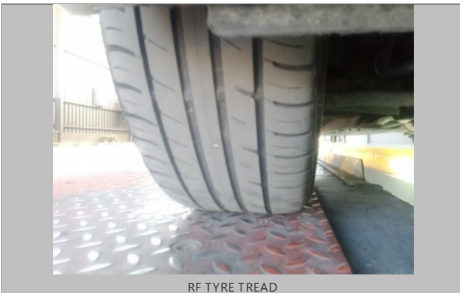
RF TYRE TREAD