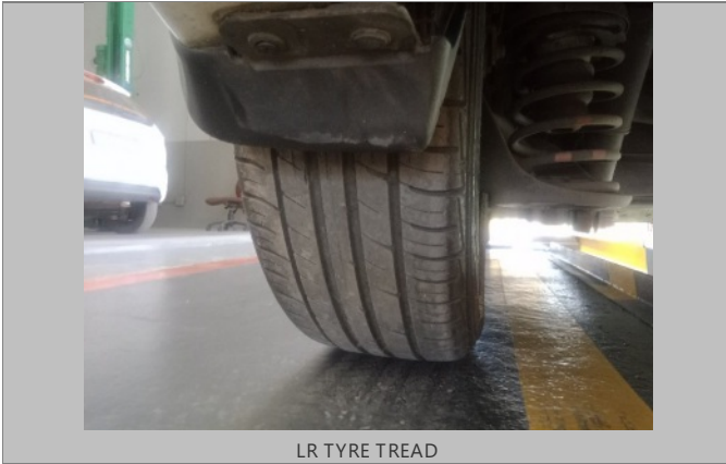
LR TYRE TREAD