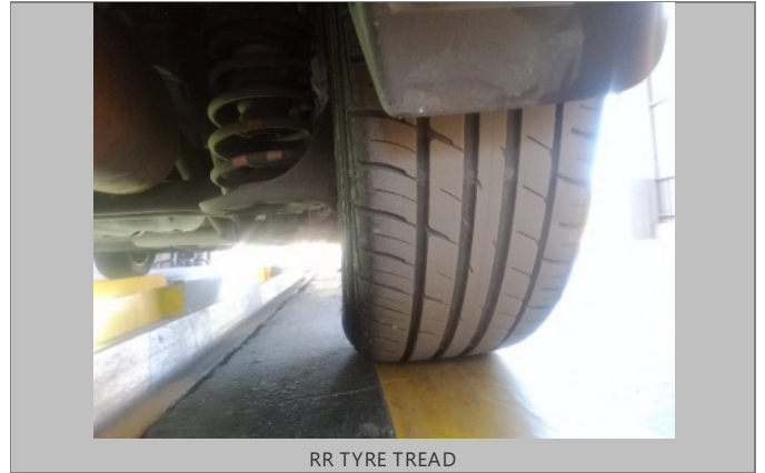
RR TYRE TREAD